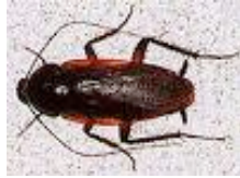
Smoky Brown Cockroach