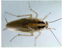
German Cockroach Cockroach